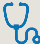
Health and Education Service Providers