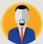
Union Parishad Chairpersons and Members